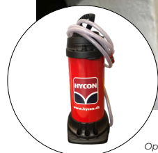
Optional Dust suppression kit Item no. 3030051